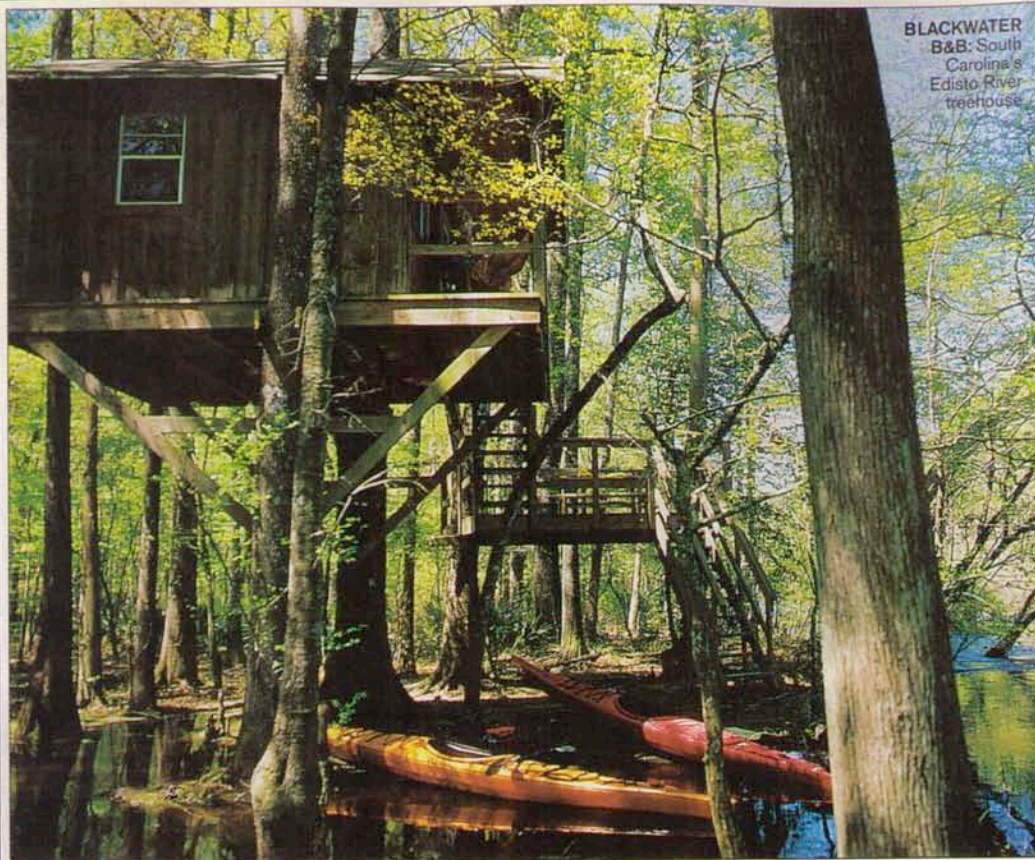
BLACKWATER B&B: South Carolina's Edisto River treehouse